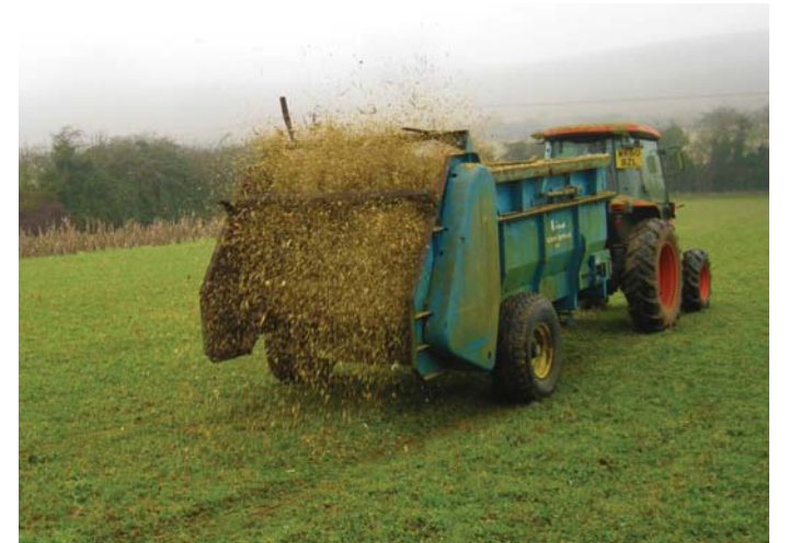
Spreading ramial woodchip onto the trial plots at Tolhurst Organics, 2018.