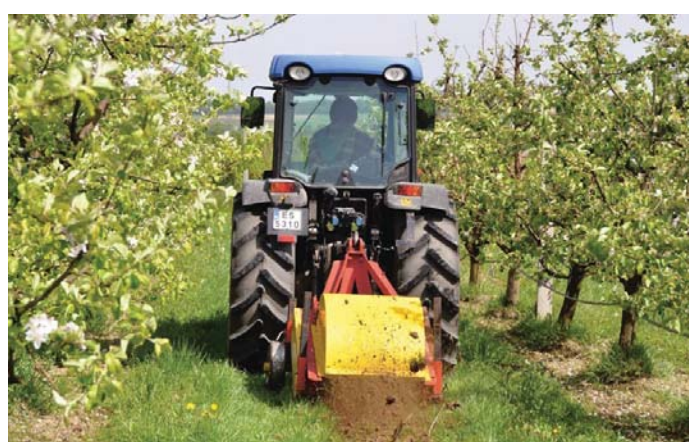
The recommended width for flower strips is equal to the inner distance between the tractor wheels plus 10cm, resulting in a 5 to 10 cm overlap into the tractor track at each wheel.