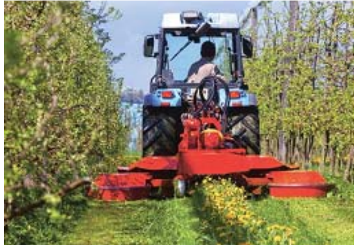
Mulching device in action (Humus OMB®).

Perennial, highly diverse mixtures need about three to four cuttings or mulching per year.