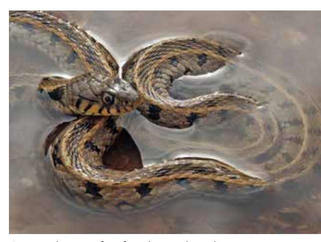
Grass snakes are often found around ponds

Ponds are one of the richest freshwater habitats. At a landscape scale, they will support more large invertebrates than rivers, ditches and streams. They vary greatly in their size and characteristics, but a healthy pond will contain a diverse community of plants and aquatic invertebrates.