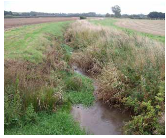
In arable areas, buffer strips can act as barriers to run-off and pollution