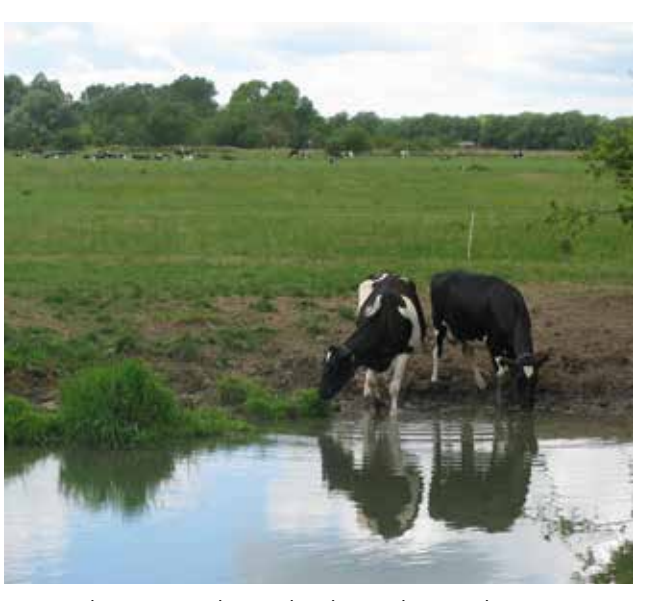
Too much grazing and trampling by stock can reduce water quality and degrade the bankside habitat

Aspects of modern agriculture, such as high stocking rates, fertiliser and pesticide inputs, and drainage are among the factors putting pressure on the habitat for wildlife. Many of these