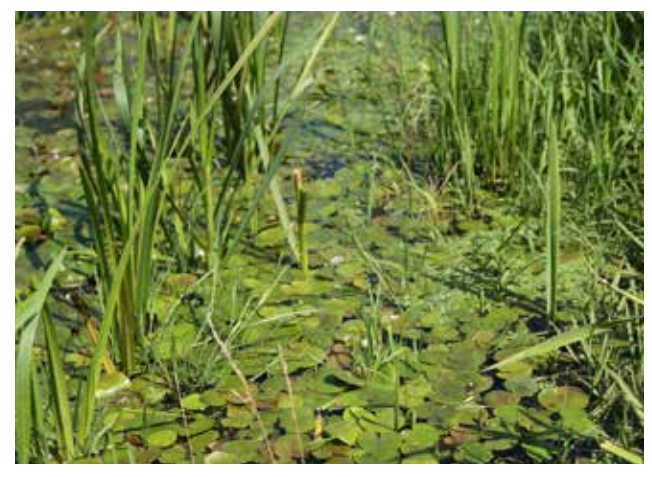
Frog-bit in farm ditch

Cattle create a variety of habitats by poaching shallow margins and grazing. Grazing the ditch edges benefits plants and a variety of invertebrates. However, fencing off some sections will permit the growth of taller vegetation, targeting species such as reed buntings and water voles.