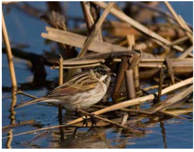
Reed buntings use ditches for feeding

Some species require particular ditch profiles, so aiming for a variety of ditch bank profiles around the farm will help a greater diversity of species to find suitable habitats. For example, water voles and kingfishers prefer steeper banks, but the majority of wetland plants and invertebrates prefer very shallow water. Shallow ditch edges are particularly important in areas where waders breed, to provide access to insect rich feeding areas and prevent chicks being trapped in steep-sided ditches. Where possible the shallower slopes should receive the most sunlight: gentle slopes on south-facing banks provide excellent habitat for a variety of plants and animals.