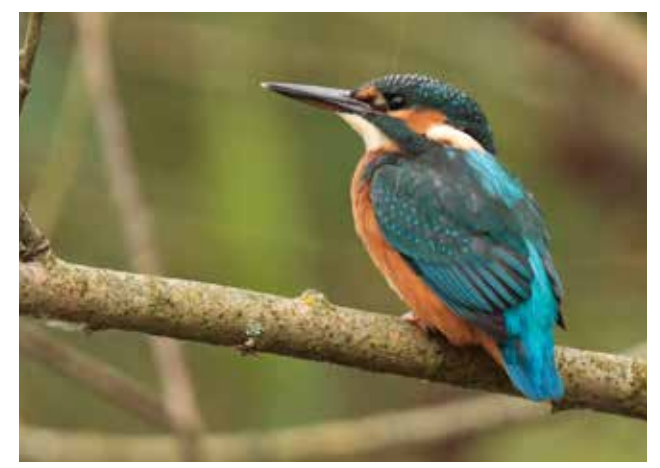
Kingfishers will benefit from measures that improve water quality of rivers and streams