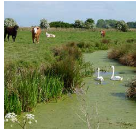
Ditches in cattle grazing marsh are often species-rich

Farmland ditches provide a range of wildlife habitats in the form of water (which can vary in quantity and permanence), channel substrate, and aquatic, bank side and bank top vegetation. Ditches provide important habitat for farmland birds, invertebrates, plants, amphibians and reptiles, and mammals. Some priority species are especially associated with ditches. Of the 70 Biodiversity Action Plan (BAP) species listed as being associated with ponds, around 20 are also associated with ditch