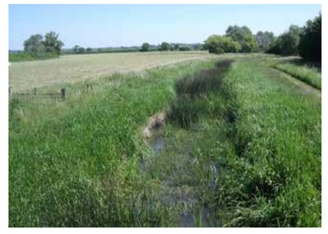
Fencing to restrict access by livestock has many environmental and wildlife benefits