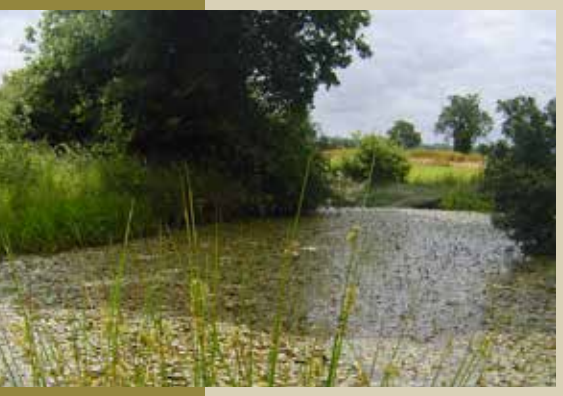
An ideal pond for dragonflies