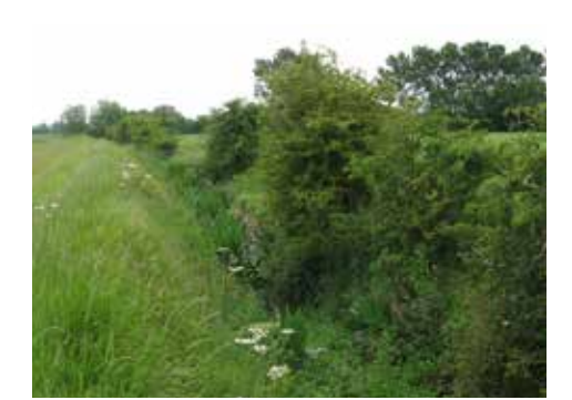
Hedges and margins can add to the wildlife value of a ditch

In some places that are prone to flooding, land drainage has created grazing marsh, which is damp pasture with networks of ditches. The wildlife interest of these coastal and floodplain grazing marshes generally lies in the water-bodies, rather than the grassland, with the ditches being particularly important for invertebrates. Grazing marshes throughout England and Wales have distinctly different habitats and species, so need to be managed in specific ways to protect their wildlife.