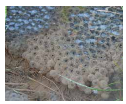
Frogs and toads will spawn in ditches