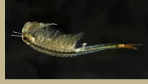
airy shrimps need ponds that regularly dry out Dirk Ercken

them under threat. Temporary ponds should not be filled in, or dug out to create permanent ponds, and they often benefit from some trampling by livestock.