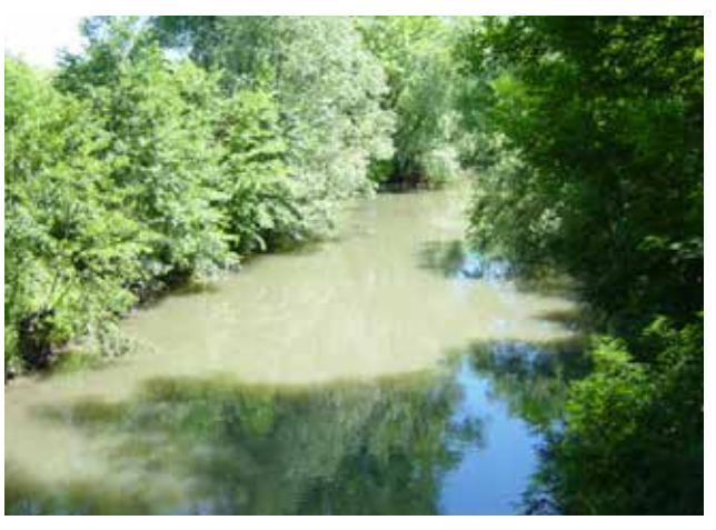
Ponds with poor quality water will support less wildlife