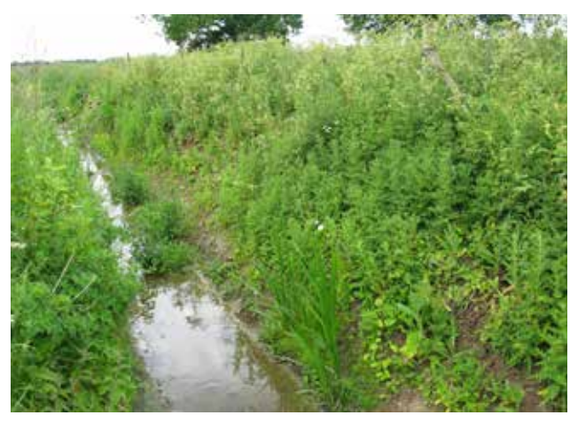
A recently cleared ditch with recovering vegetation

Some species require particular ditch profiles, so aiming for a variety of ditch bank profiles around the farm will help a greater diversity of species to find suitable habitats. For example, water voles and kingfishers prefer steeper banks, but the majority of wetland plants and invertebrates prefer very shallow water. Shallow ditch edges are particularly important in areas where waders breed, to provide access to insect rich feeding areas and prevent chicks being trapped in steep-sided ditches. Where possible the shallower slopes should receive the most sunlight: gentle slopes on south-facing banks provide excellent habitat for a variety of plants and animals.