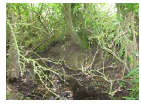
Where hedgerows are overgrown, ditches may become shaded and poorer for wildlife

Ditches in more intensively farmed land are often found next to field margins and hedgerows (Box 14), which can act as important buffers for ditch communities, as well as adding to the range of habitats available for wildlife. The management of these adjoining habitats is important. Well managed hedgerows and field margins will add to the wildlife value of the ditch, but allowing hedgerows to become very overgrown can shade out the ditch, resulting in a poorer community of plants and animals.