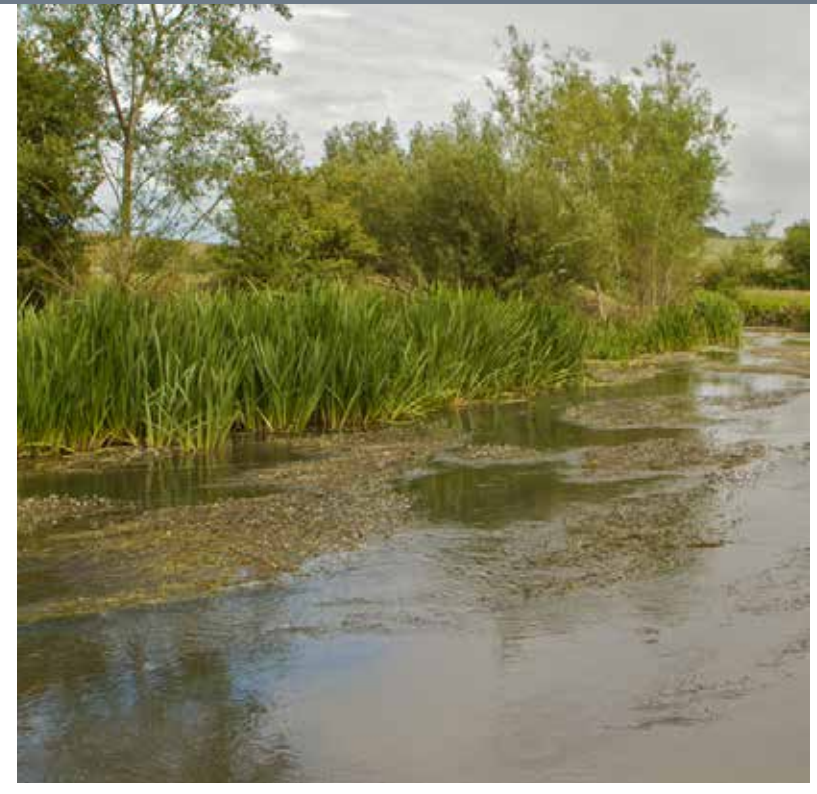
River Windrush