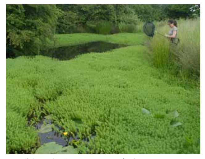
A pond clogged with invasive parrot's feather