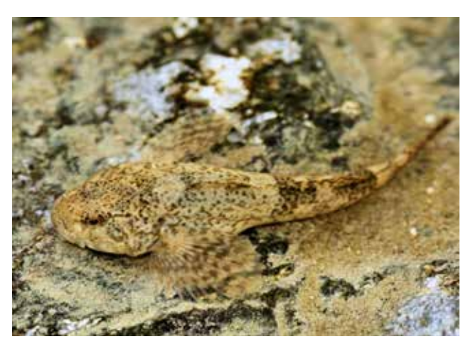
The bullhead has been affected by silting of streams

negative impacts can be mitigated through careful land management practices. For example, fencing and providing alternative drinking arrangements for cattle can reduce sediment and nutrient inputs, leading to improved water quality, stock health and productivity. Creation of buffer strips and the management of bankside vegetation help to protect the watercourse from agrochemical inputs and add to the wildlife habitat available, and selective coppicing of bankside trees can improve fisheries. Other threats to native wildlife, such as those from invasive or alien species, may need targeted management (Box 15).