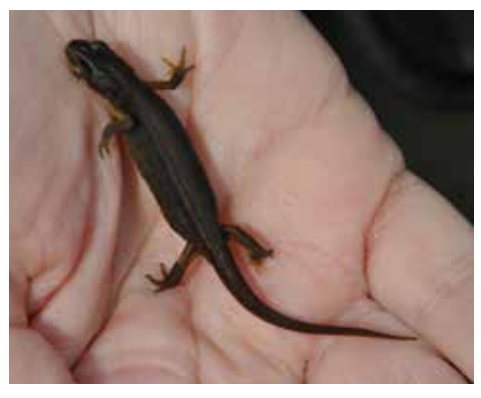
Newts may arrive in ponds in spring

In areas of clean unpolluted water, deeper sections of the pond will support many submerged and floating leaved plants. But ponds deeper than 1-1.5m provide little additional value for wildlife. Varying the depths across the pond will create a range of beneficial habitats for plants and animals.