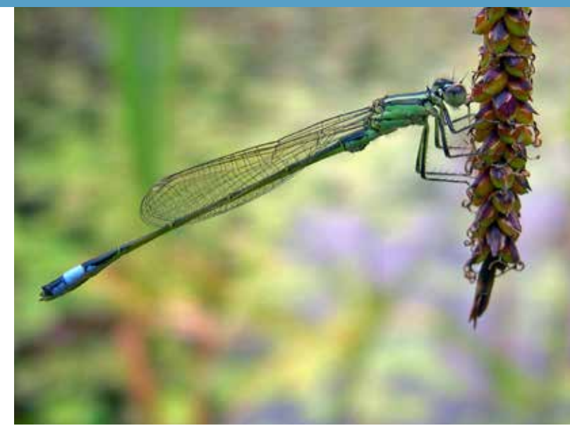
Blue-tailed damselflies are found in ditches