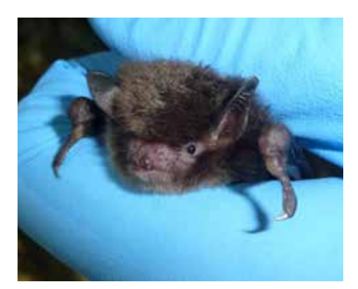
Daubenton's bats hunt along rivers