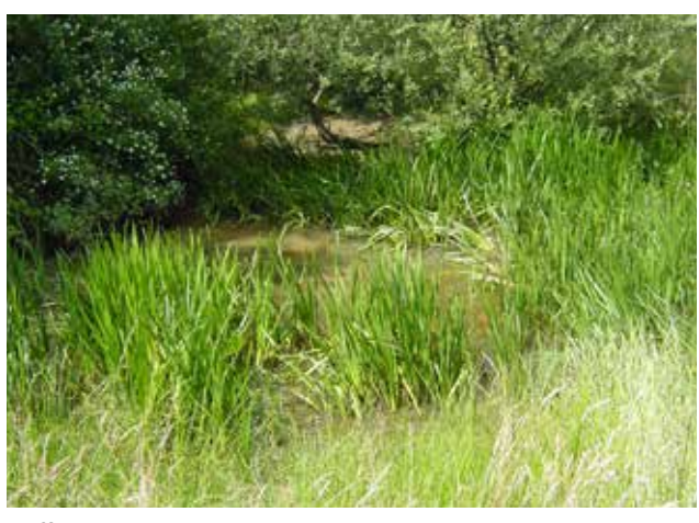
Buffer strips around ponds can help improve water quality © Eva Raebel

There are lots of myths about the need to manage ponds. Most wildlife ponds don't need to be managed to keep their wildlife value, unless they contain a rare species which has very specific habitat requirements. Poor pond management has the potential to do more harm than good. Decide which ponds on the farm you want to be for wildlife, as you will manage these differently from ponds which have been created for other uses, such as drainage or fishing.