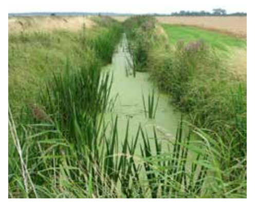
Water voles need well-vegetated riverbanks

Streams and rivers are home to a wide range of plants and animals, which are dependent upon freshwater habitats for their survival. Submerged, emergent and floating plants, and a range of substrate types and water depths (for example, riffle pool systems), provide habitat for aquatic invertebrates, and shelter and cover for fish. As well as species that live within the water, many others rely on streams and rivers as foraging or breeding habitat. Riparian vegetation is especially important. Many birds depend on these habitats for foraging and nesting, and water voles need well vegetated banks for their burrows.