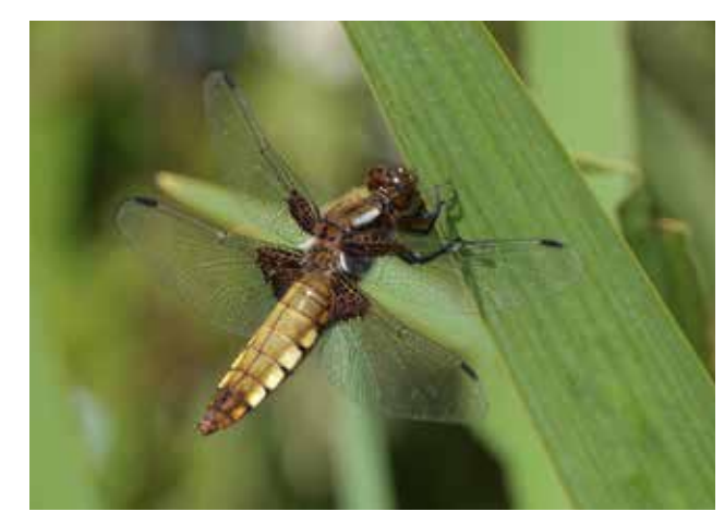
Broad-bodied chasers are one of the first dragonflies to colonise a pond

The three basic principles for creating a good wildlife pond are: first, find a place with a clean water source; second, leave the pond to be colonised naturally and third, ensure the pond is protected from damaging impacts once it is created.