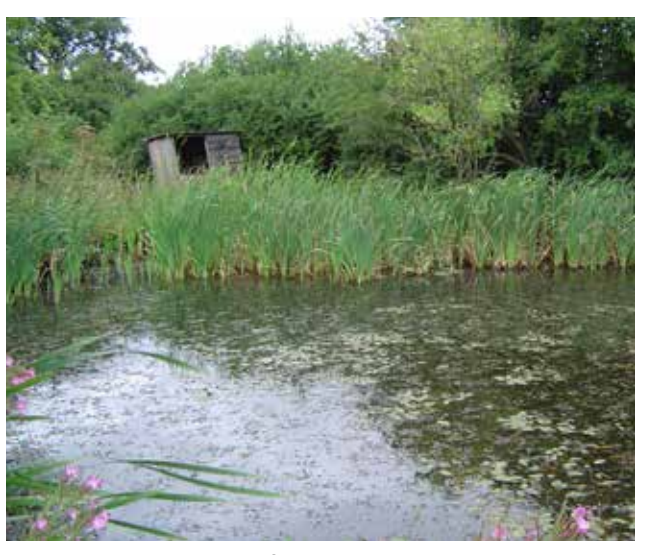
Good water quality is vital for a healthy pond

Creating a pond for wildlife is straightforward if a few basic guidelines are followed. Once established, a pond should need little intervention for many years. As a pond matures, the plant and animal communities it supports will change; both young and old ponds are good for wildlife, and the more ponds in the landscape, the better (Box 12).