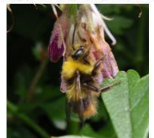
Early bumblebee & Comfrey