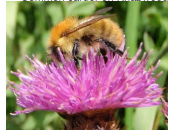
Common carder on Knapweed