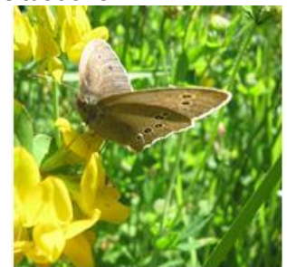
Ringlet & Greater Bird's Foot Trefoil