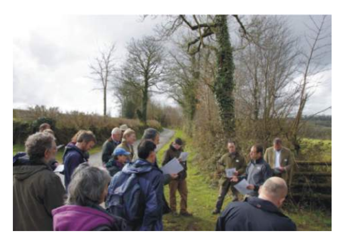
Discussing the wood fuel crop of a hedge. Both a quick appraisal chart (see Table 3 on page 14 and on-line detailed assessment tool (see Resources are available to help estimate likely yield from hedges. Collacombe Barton, Lamerton, Devon, March 2013.