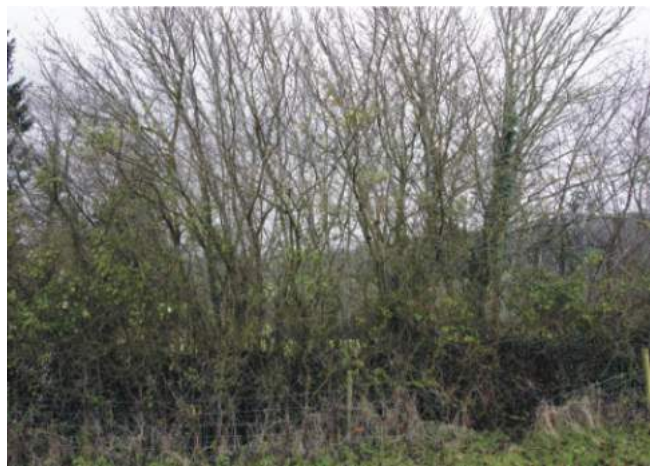
3 Typical hedge ready to be laid ('Point of Lay', 4-5m high. Underdown Farm, Yarcombe, Devon, January 2012.