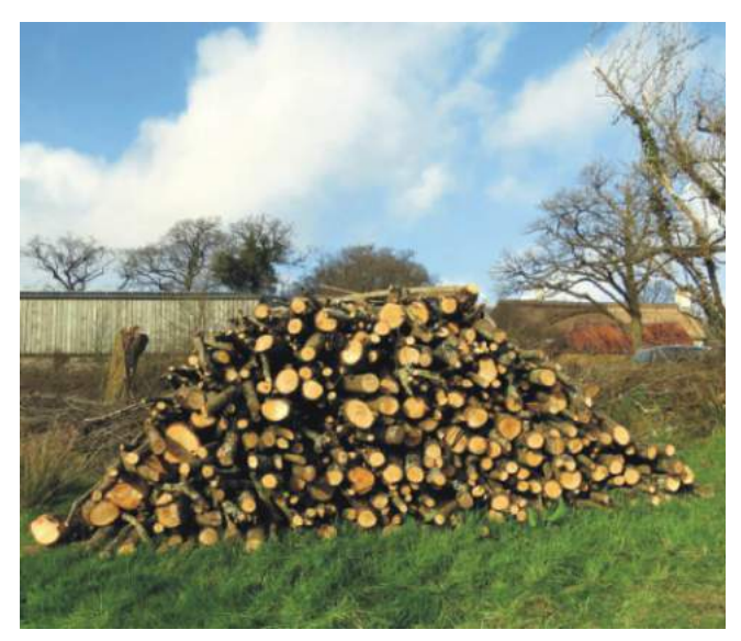
Wood from a coppiced willow hedge with 17 years growth. The cordwood will be cut up and used in wood stoves to heat the farmhouse. Locks Park Farm, Hatherleigh, West Devon, March 2014.

For many centuries firewood from hedges was considered a valuable crop. It was only in the latter half of the 20th Century that this use fell out of fashion because of rising labour costs and ready availability of cheap alternative fuels. Now, with new cost-effective cropping techniques and rising oil prices, it once more makes economic sense to manage hedges for biomass (that is energy, and farmers and others are starting to do so. They see hedges as having a direct economic value, and so the future of hedges becomes more secure with the resumption of positive and sustainable management. Better still, it's a renewable source of energy, helping to mitigate climate change.