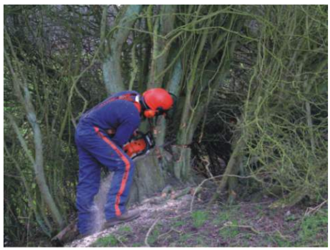
Hedges should normally be cropped for fuel when ready for coppicing, typically 5-8 years after they are ready for laying. Above: coppicing a hawthorn stool. Below: coppiced hazel stool.

Hedges managed without top-cutting and by coppicing will be less well protected from grazing animals than those which are cut regularly and laid. The banks in particular will be more vulnerable to damage through livestock trampling, and the new growth at risk from rabbits, deer, etc. In practice it is often possible to coppice most of the stems in a south-west banked hedge but still lay enough of the smaller ones to create a stock-proof boundary or for wildlife reasons. It remains likely, though, that coppiced hedges will need to be fenced on stock farms, but fencing is normal practice nowadays even after hedge laying, so managing for fuel may not add to costs in this respect. If coppicing is carried out at 15 - 20 year intervals, as recommended. this fits in well with the expected life of treated wooden fence posts. However, if fences are expected to last for longer, then they should be set well away from the bank, to facilitate future cropping.