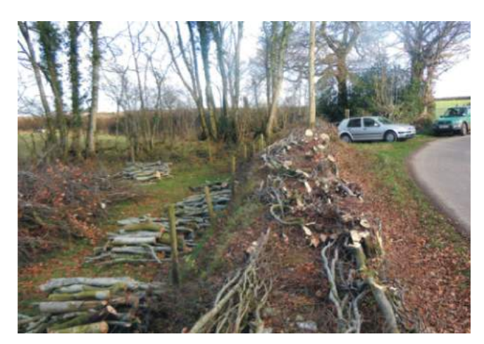
Beech hedge harvested at coppice stage for logs. Most stems have been coppiced, but a few smaller ones have been retained and laid. Way Close, Madford, Blackdown Hills. January 2012.

Figures from Normandy show that for every one unit of fossil fuel used to operate the Coppice + Chip system, 44 units of renewable energy are produced a ratio higher than for Short Rotation Coppice (1:33 or Miscanthus (1:27 . Such figures for the Lay + Log system are not available, but since the only fossil fuel likely to be used is for chainsaws and on-farm transport, will be even more favourable than for the Coppice + Chip system.