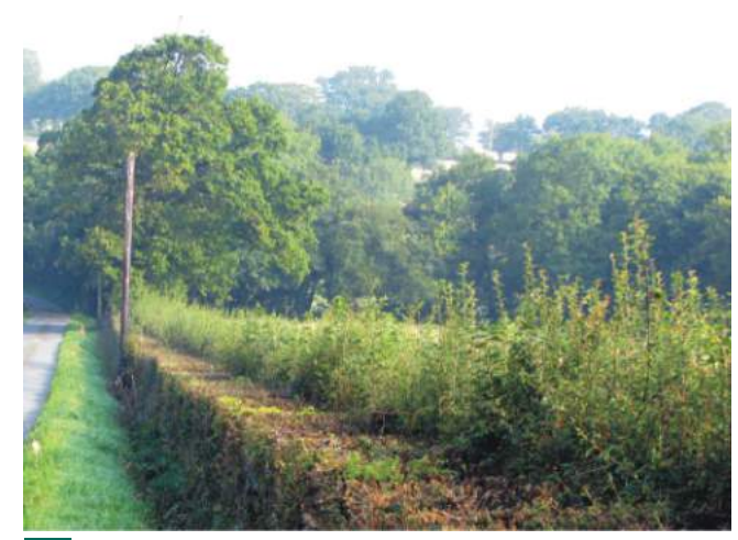
2 Typical flailed south-west England hedge. Highampton, Devon, September 2008.