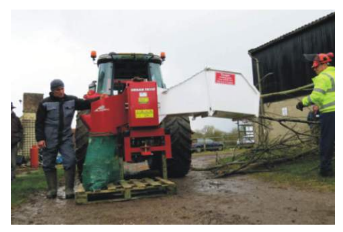
Branch logger in use. Elm Farm, March 2014.