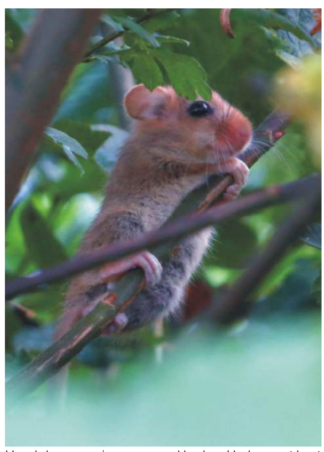
Hazel dormouse in a managed hedge. Hedges not kept thick and bushy by regular cutting are poor nesting habitat for dormice, but produce more berries and nuts for them to eat.

Managing for woodfuel can help, at a landscape scale, to ensure that the worldclass networks of hedges found in the southwest of England remain intact into the future. It will counter the two current prevailing trends of either cutting hedges repeatedly to the same height year after year or of neglecting them altogether: both these trends lead eventually to the loss of hedges. However, in the shorter term, managing for woodfuel can have harmful impacts on the wildlife of individual hedges and perhaps on the appearance of the landscape and social amenity (e.g. public access and views from private properties. These impacts need to be assessed and mitigated.