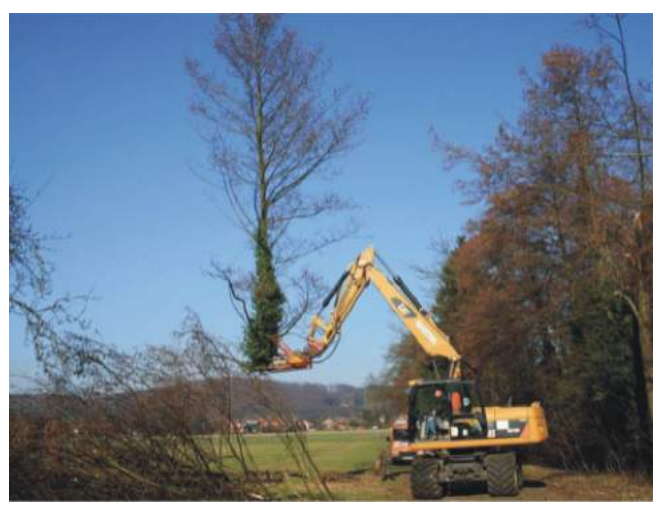
Hedge tree felled and being lifted clear by an excavator with feller-buncher head.

In parts of Devon and Cornwall the ground is unlikely to be able to support heavy machinery during the winter months. This will limit the use of tractors and excavators, and is an important factor to consider.