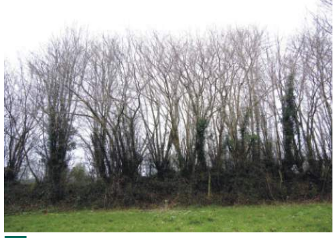
Typical hedge ready to be coppiced ('Point of Coppice', 6-7m high. Higher Hampt Farm, Luckett, Cornwall, January 2012.