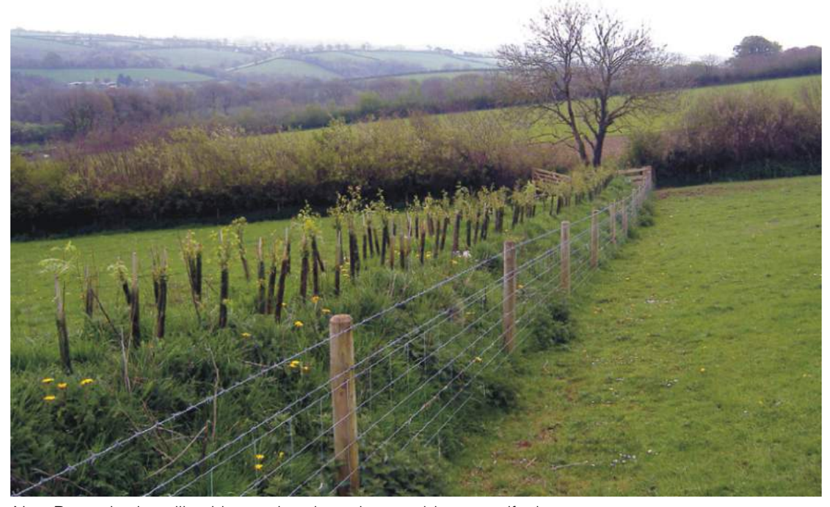
New Devon hedges like this may be planted to provide a woodfuel crop. Wonnacott Farm, West Devon.

Planning consent may be required for new banked hedges. Although the construction of new banked hedges might be considered to be permitted development, it is sensible to consult your local council before starting such work. Where materials are to be imported on to your land for this purpose, it is necessary to seek a waste management licence exemption from the Environment Agency.