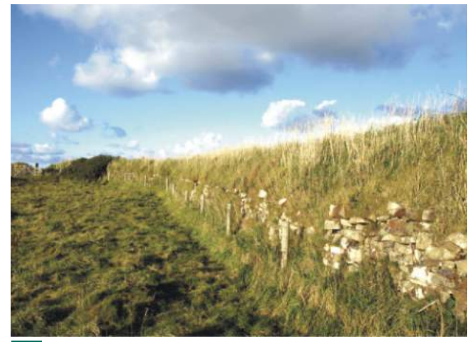
1 Hedge consisting of a bank only. Speke's Mill Mouth, Welcombe, Devon, October 2010.

These six photos show the major points in the hedge management cycle that need to be recognised before a hedge's standing woodfuel crop can be estimated (see Table 3, opposite.