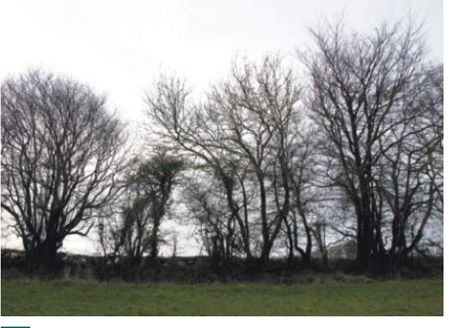
Typical hedge developed into line of semimature trees, 8m+ high. Cotley Farm, Axminster, Devon, December 2011.