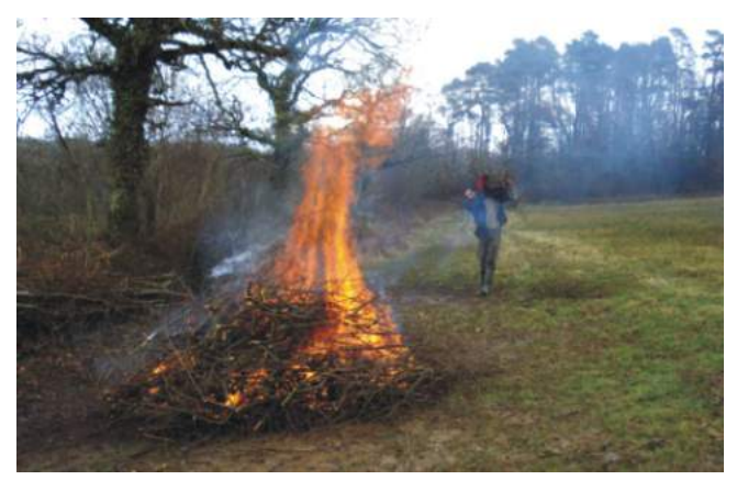
Brash being burnt after hedge laying. About 80% of total available biomass, and therefore energy, was wasted, either as steepers (laid stems retained in the hedge or in the bonfire. Locks Park Farm, Hatherleigh, West Devon, December 2008.

Chips can be produced much more efficiently than logs in terms of time, labour and cost. Also, 100% of the harvested material can be used<sup>6</sup>. On the downside, woodchip boilers are three or four times more expensive to buy and install than log boilers. More information is given on how to produce chips efficiently from hedges in the next section.