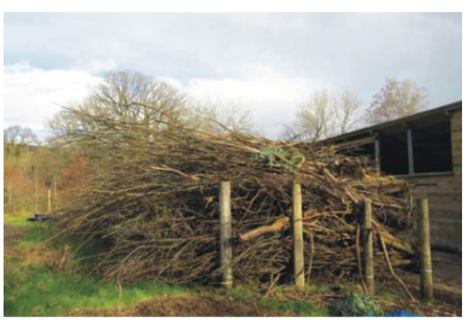
Young trees air drying prior to chipping with whole tree chipper. The shed behind houses a boiler and chips are blown direct from the chipper into the feed hopper. Whitemoor Farm, Doddiscombsleigh, Devon, Feb. 2014.

A variation on this system is to chip only the air-dried cordwood arising from hedges. The advantage of this is that a large whole tree chipper is not necessary, adequate machines being readily available from local machinery hire centres. However, the brashwood will have been wasted and much more manual handling is likely to be required. As noted above, the wear and tear on chippers is greater and chip quality likely to suffer when using seasoned wood as opposed to green wood.