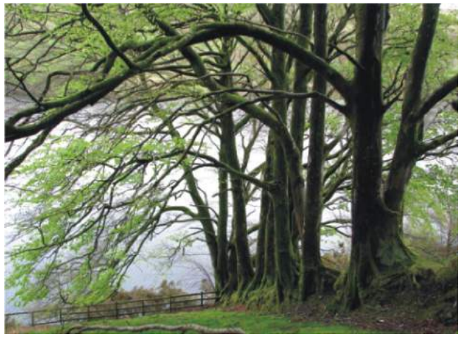
Beech hedge which has developed into line of mature trees, 8m+ high. Meldon, Okehampton, Devon, April 2009.