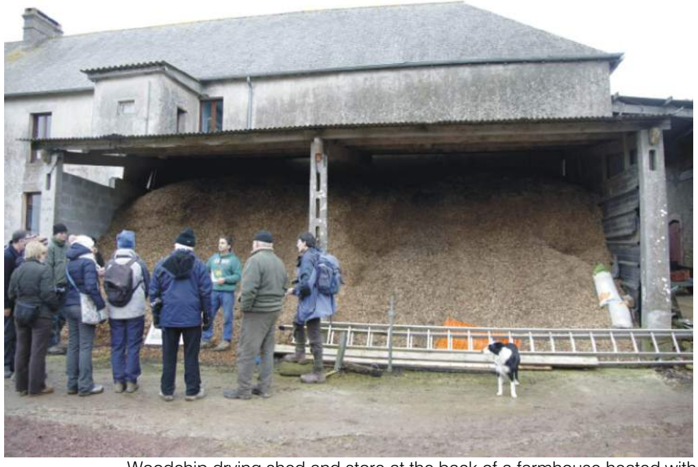
Woodchip drying shed and store at the back of a farmhouse heated with woodchips from farm hedges. The chips self-dry through fermentation. La Tournerie, Raids, Normandy, February 2012.

Modern woodchip boilers are highly efficient, performing nearly as well as condensing oil burners, at over 90% efficiency. They produce remarkably little ash, perhaps a dustbin full after a full season of heating a farmhouse. Quality makes are highly reliable and nearly as simple to operate as oil burners. They are selffeeding through an auger drive from the hopper. Problems are only likely to arise if poor quality chips are used, especially if pencil-shaped chips, or shards, are present. For this reason, only fuel-grade chippers should normally be used, which sieve out shards. Critically, it is important to match the fuel grade to the boiler. Large boilers are generally more tolerant of chips of inconsistent size and shape than small ones. Machines that shred rather than chop or cut wood into pieces are unlikely to produce chips of adequate quality.