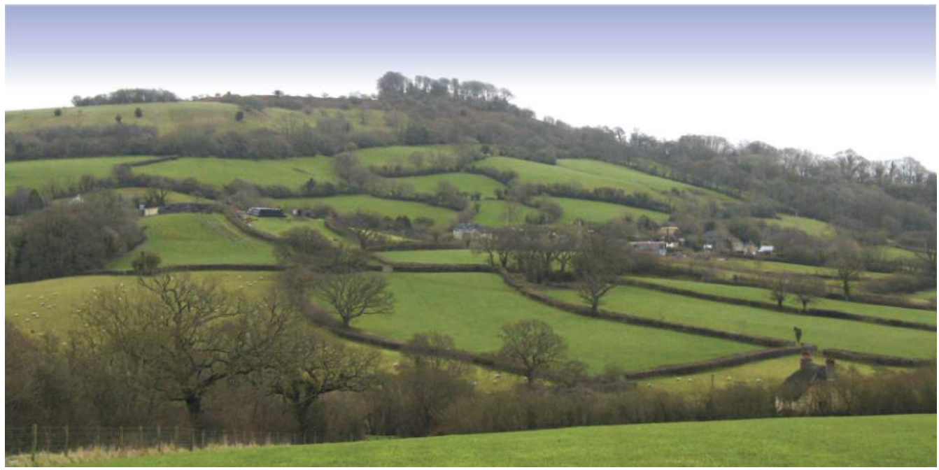
Well-hedged landscape typical of much of south-west England. Note that although some hedges are cut short, others are developing into lines of trees: managing farm hedges for woodfuel is unlikely to have a major impact on landscape appearance. Near Honiton, Blackdowns, January 2012.

Hawthorn - Crataegus monogyna; Hazel - Corylus avellana; Oak - Quercus species; Poplar - Populus species; Sycamore - Acer pseudoplatanus; Willow - Salix species.