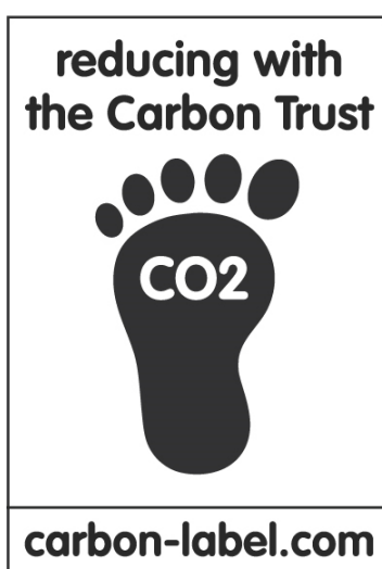
Figure 3: Carbon label from Carbon Trust Footprint Company.

One of the benefits of an LCA approach is that it can help companies identify carbon intensive 'hotspots' in their supply chain and work towards reducing their emissions (Maung, 2009). In addition, such assessments can be used to label the environmental attributes of products in the market place. For example, companies completing a PAS 2050 compliant assessment can apply to the Carbon Trust Footprint Company to display a logo on their packaging indicating their CO 2 footprint, and stating that they are taking action to reduce their impact.