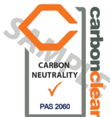
Figure 4: Carbon neutral label from Carbon Clear Limited ( www.carbon-clear.com ).

In 2010 the BSI released the PAS2060 Specification, which sets out general requirements for anyone who wants to achieve and demonstrate carbon neutrality. The aim of the specification is to increase the transparency of claims in this area by providing a common definition and a selection of appropriate methods for offsets. The standard is targeted at organisations, communities or individuals who wish to demonstrate actions being taken to offset their emissions in order to save energy and gain customer confidence. For more information on the Specification please visit: http://shop.bsigroup.com/en/ProductDetail/?pid=000000000030198309 .