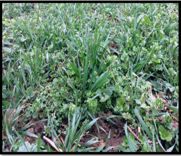
These photos show the difference in wheat and weed ground cover between January and March.

The weeds will also now be competing strongly for nutrients available from the soil and necessitating control as soon as conditions allow to reduce competition for light and nutrients. Later on competition for water is also likely to be an important issue, especially on the thin Cotswold brash soils on which this experiment is being conducted.