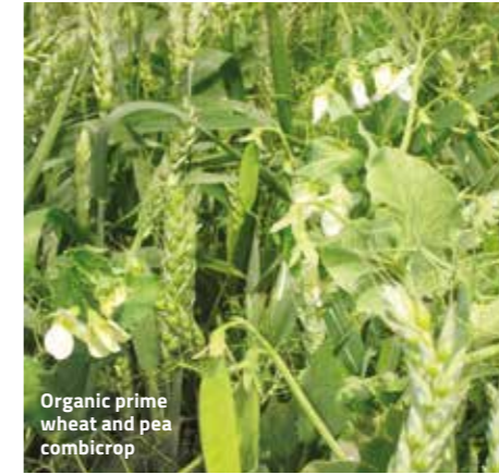
Organic prime wheat and pea comcrop

Maize was grown before organic conversion and, although Henry grew it organically for some years, the difficulties of weed control and the inconsistent yields