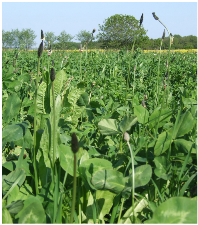
Herbs in pasture

Other SOLID farmer-led projects are also relevant to animal health and welfare for example, two studies were carried out in Denmark and UK about rearing calves on cows (see Technical Note 8: Rearing calves on milking cows).