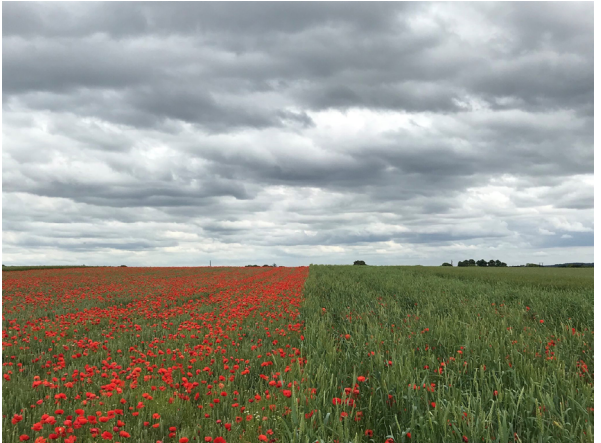
Figure 1 Different weed suppressive ability by a modern (left) and a historic (right) wheat variety grown in the same field

Collective experiments can be a powerful tool for co-learning between researchers, farmers and supply chain stakeholders. By working together, the industry, and any farmer engaged in a journey towards a more sustainable production with reduced use of chemicals, can be empowered to independently generate the evidence needed for on-farm decision making.